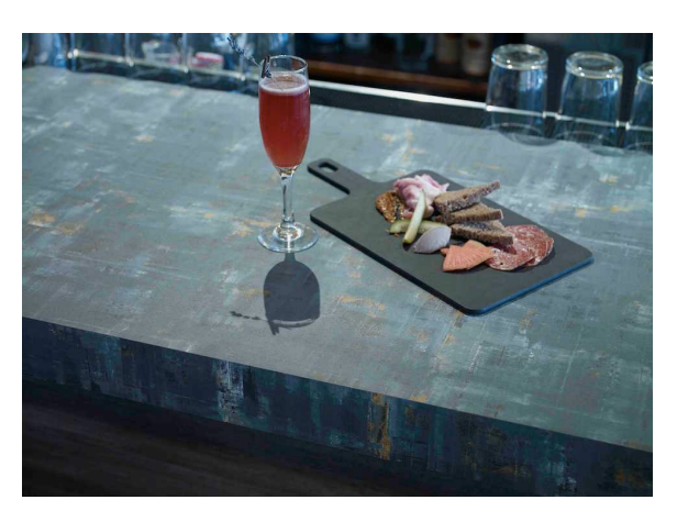
8994 - Paint Scrape Steel

This palette's bold primary tones used in contrasting combinations add richness and depth as well as a contemporary vibe to any space. Chrome Yellow, Matrix Blue and Spectrum Green create bold and vibrant spaces.