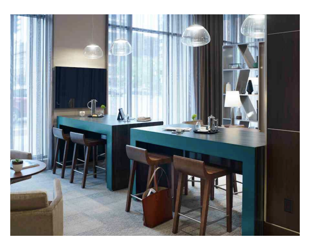
8918 - Blackened Steel

The Personal Sanctuary palette celebrates emotional connections to everyday objects as personal time and spaces become more precious. It includes colours and patterns in a mix of soft textures and smooth finishes that invite us to touch and interact. Frosted and translucent effects create private enclaves within large shared spaces, while the patina of aged metal and woodgrains evoke the Scandinavian way of living well and simply.