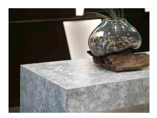
8958 - Bubble Art

For example, two Paper Terrazzo patterns use small fragments of post-production solid colour paper from Formica® Laminate that would otherwise have gone to waste to create a bold, textured-looking pattern. The palette also includes three Bubble designs, which are the product of printing inks mixed with soap and bubbles blown on