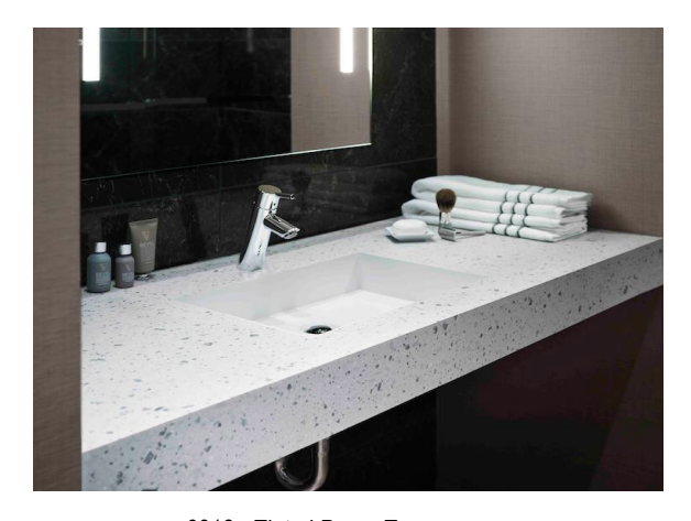
8812 - Tinted Paper Terrazzo

Nature and man-made materials come together to create something entirely new and eco-friendly. Taking recycling one step further, we rethought what we throw away to produce something truly original. The intent is not only to maximize our resources but also to manipulate and combine them with synthetic materials to create intriguing new composites.